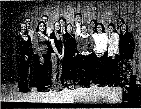
John Marshall English Class