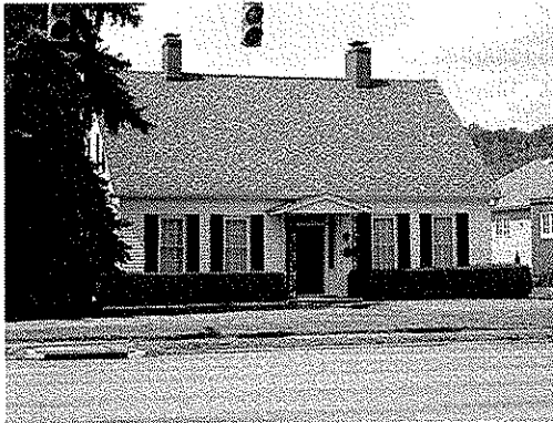
Smaller Cockayne House