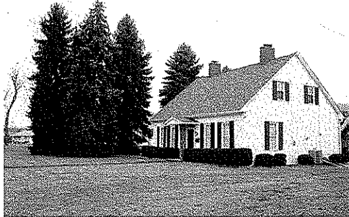
Lisa Cockayne House

Please Continue to Support the Cockayne Project!