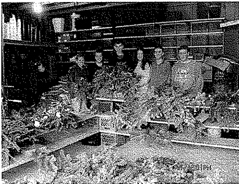
John Marshall Horticulture Class

Earlier this year, the Cockayne Project received a grant to hire a part-time staff person to further develop educational and cultural programming and to create more ties with the Marshall County Schools. A steering committee of teachers and community leaders has been organized and ads will be placed for this position. It is also hoped that college interns can be found to further the work of the project under the tutelage of the future staff person.